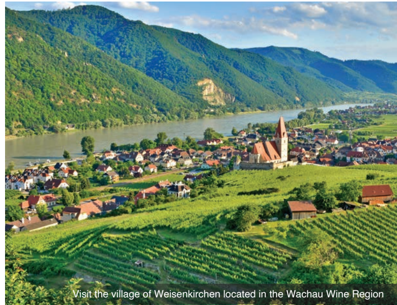
Visit the village of Weisenkirchen located in the Wachau Wine Region

DAY 1 Depart the USA: Depart the USA on your overnight flight to Budapest, Hungary.