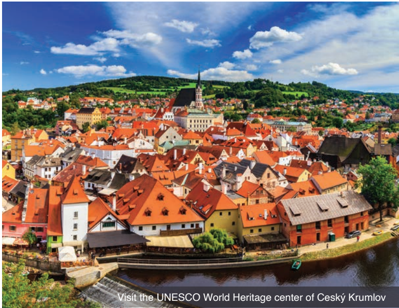
Visit the UNESCO World Heritage center of Český Krumlov

After the included visit to Melk Abbey, choose to join the optional excursion to Schallaburg Castle or enjoy free time in Melk.