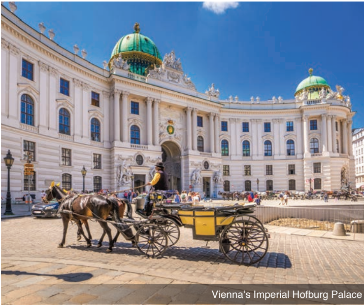
Vienna's Imperial Hofburg Palace